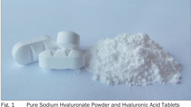
g. 1 Pure Sodium Hyaluronate Powder and Hyaluronic Acid Tablets Composed of PROSOLV<sup>®</sup> EASYtab Nutra CM and 40 % Sodium Hyaluronate.

Nutra CM tablets, which do not show friability, in combination with a smooth tablet surface is the ideal basis to apply an enteric coating to protect the hyaluronic acid against gastric juices.