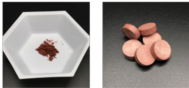
Pic 1 Pomegranate Extract Powder (left) and Finished Pomegranate Tablets (right)

The PROSOLV® EASYtab Nutra made it possible to simply directly compress pomegranate extract into tablets with good physical integrity. Two formulations were made with 50 % and 60 % PROSOLV® EASYtab Nutra respectively. In general, pomegranate formulation 1 with more PROSOLV® EASYtab Nutra (60 %) made tablets with higher tensile strength compared to the tablets that only had 50 % PROSOLV® EASYtab Nutra (formulation 2). While both formulations make very hard tablets with acceptable disintegration times, additional superdisintegrant may be added if shorter disintegration times are desired.