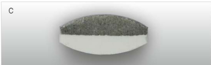
Pic 2 C An Adequate Tamping Force was Applied, Leading to a Horizontal Separation Line Between the Layers. The Top Layer Consists of Formulation S, the Lower Layer Consists of Formulation D.