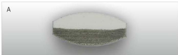
Pic 2 A An Adequate Tamping Force was Applied, Leading to a Horizontal Separation Line Between the Layers. The Top Layer Consists of Formulation D, the Lower Layer Consists of Formulation S.

The effect of tamping force was visualized by the cross section of convex bi-layer tablets. A horizontal line separated the tablet layers if an appropriate tamping force was applied (Picture 2 A and C). In contrast, the separation line between the layers was convex shaped if an excessive tamping force was applied (Picture 2 B and D). In each case, the black layer consists of formulation S and the white layer of formulation D.