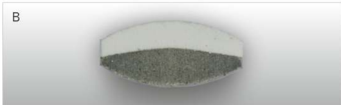
Pic 2 B An Excessive Tamping Force was Applied, Leading to a Convex Separation Line Between the Layers. The Top Layer Consists of Formulation D, the Lower Layer Consists of Formulation S.