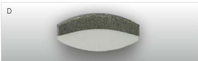
Pic 2 D An Excessive Tamping Force was Applied, Leading to a Convex Shaped Separation Line between the Layers. The Top Layer Consists of Formulation S, the Lower Layer Consists of Formulation D.